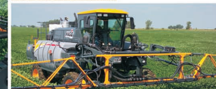
Boom height adjustment from 23"-101"