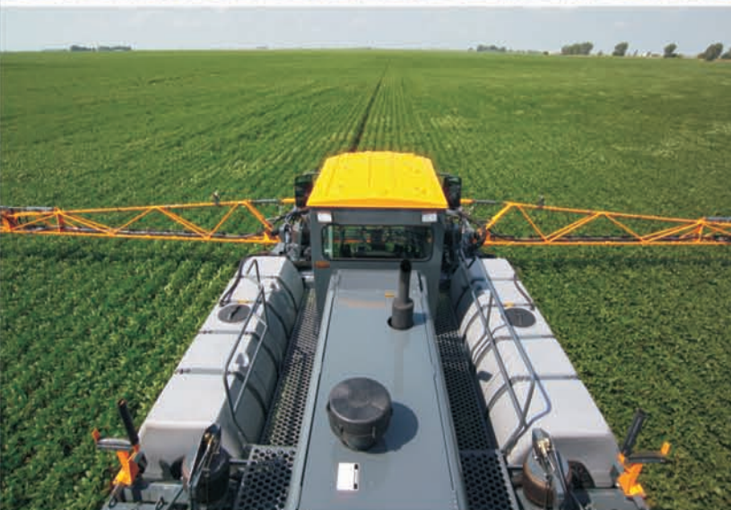
Engine located behind the cab, for a quieter more comfortable ride.