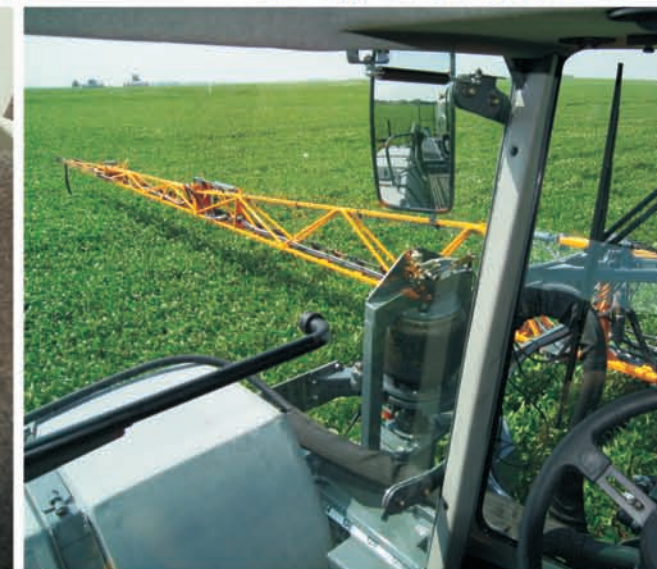
Tip-to-tip visibility of the boom