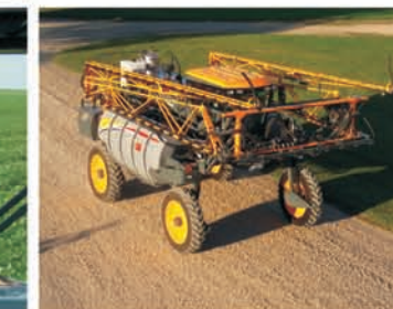
Transports and stores easily