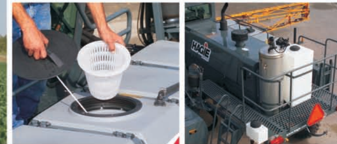
Convenient top-loading tanks