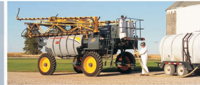
Single 2" rear fill for both tanks