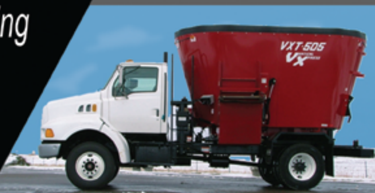
VXT - 505 Truck Mount

Made In The U.S.A. With Proven ROTO-MIX Quality!