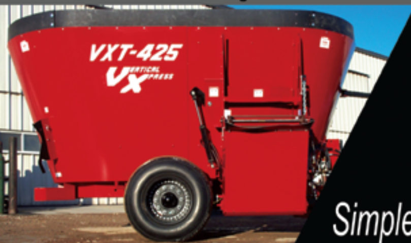
VXT - 425 Trailer