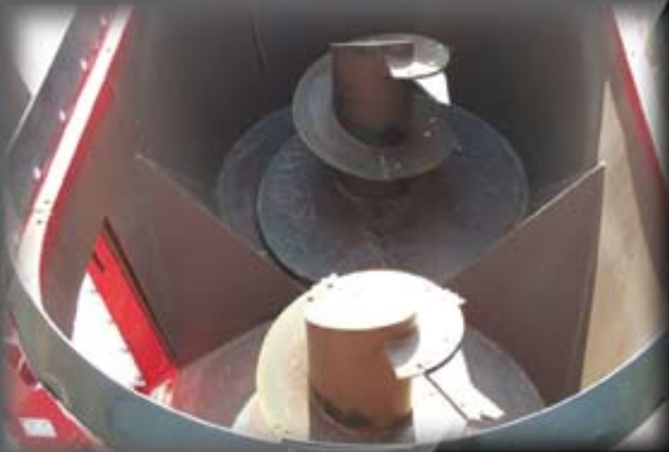
Twin Screw Design to Handle any Material