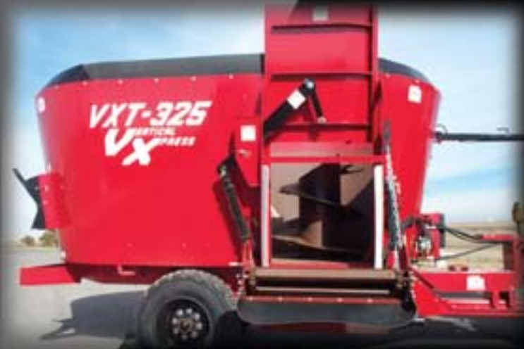
Large Door Opening for Fast Discharge of Material