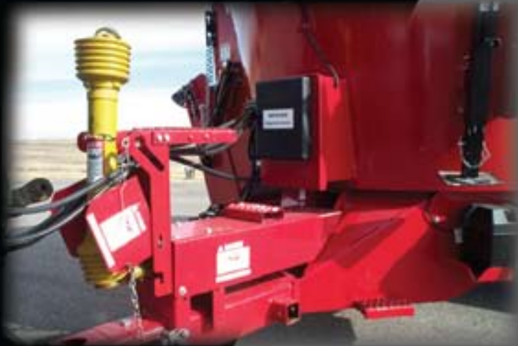
Convenient PTO Holder & Hose Storage